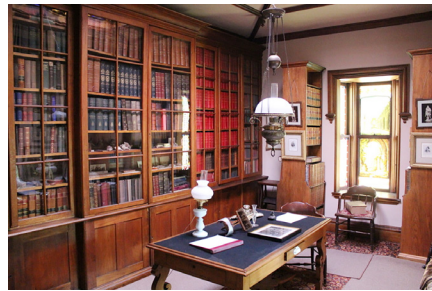
Senator Morrill's library