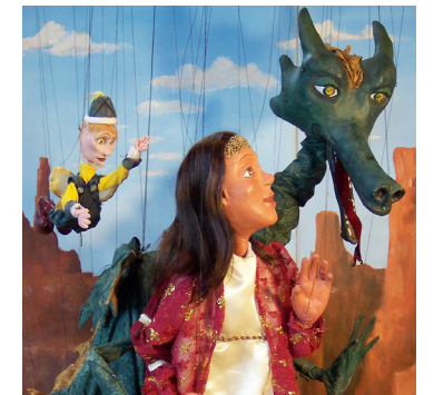
No Strings Marionettes at Open House