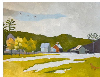
See Jennifer Brown's "Strafford Flood Plain" at Gallery in the Garden