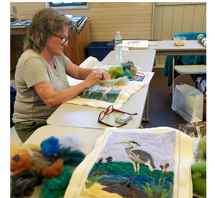
Vermont Wildlife is the theme for Tapestry Felting

The Homestead season wraps up on September 22 nd with AppleFest , a festival that has a little of everything! Live music, farm animals, cider pressing, heirloom apples, artisan cheeses, Vermont ice cream, homemade apple pie, period games, wagon rides, crafts, exhibits, and more!