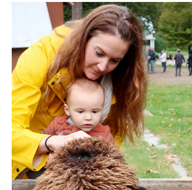
Meet farm animals at AppleFest

First up is our Open House on Sunday, June 9 th . Be our guest for an afternoon of guided house tours, Strafford Organic Ice Cream, and a puppet show with No Strings Marionettes. Soon after is a Tapestry Felting Class followed by Nature Play with Little Ones (for ages 1-6) and Regenerative Agriculture for the Home Gardener by the close of June.