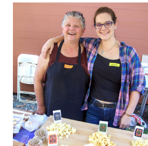
Volunteers serving cheese samples at AppleFest