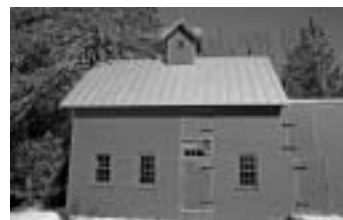
The "horse barn" under construction this spring

new career in politics, the 17-room cottage incorporates much of the stone-like detail, actually rendered in wood, that is the hallmark of Gothic Revival style. Morrill borrowed and adapted the forms and details of the Gothic Revival to suit his own particular needs and vision.