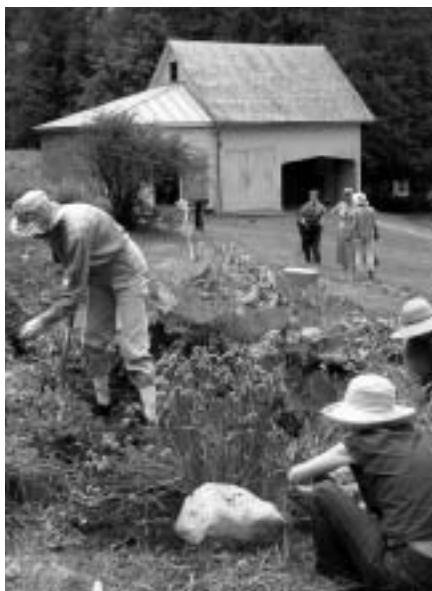
Above: Master Gardener volunteers prepare the Kitchen Garden